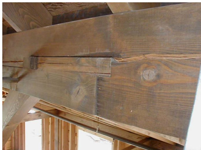
Figure 3 Failed scarf joint

Splitting caused by restraint of volume change movements has been discussed but splitting can also be caused by a