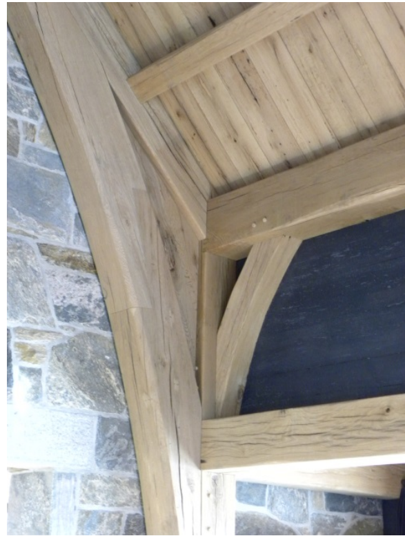
Figure 1 Scarfed cruck splice

When all else fails and timber moment connections are deemed unavoidable, the engineer should proceed with extreme caution.