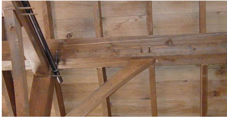
Figure 4 Applying a dark stain to green timbers will make checks appear more pronounced

stresses published in the supplement to the National Design Specification for Wood Construction (NDS) are based on the conservative assumption of the most severe checks, shake, or splits possible, as if the timber were split through its full thickness for its full length. Prior to the 2001 edition of the NDS, there were provisions in the standard that allowed for an increase in the allowable shear stress by a factor of 2.0 if you could verify that there were no splits or checks present at the end of the timber.